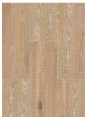
MICODUR 200611 Oak Craggy