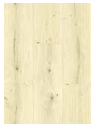
MICODUR 201421 Oak Como White