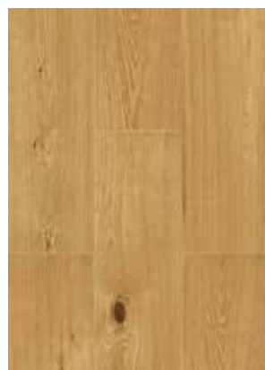
MICODUR 201225 Oak Light