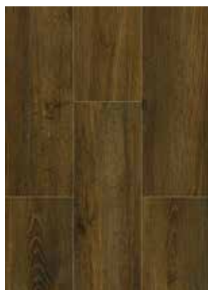
MICODUR 201016 Oak Olive Flamed