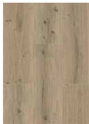
MICODUR 201406 Oak Como Grey